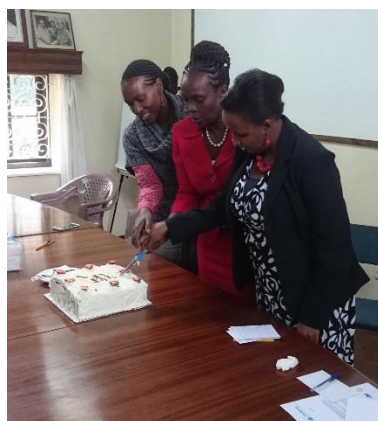
Inset from L, Executive Officer, Chief Commissioner and Deputy Chief Commissioner