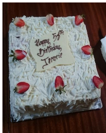
Cake cutting on 30 July, CC's Birthday

KGGA fraternity wishes our Chief Commissioner a happy 58 th birthday. May God grant you many more years. Thank you for your selfless service to guiding in Kenya.